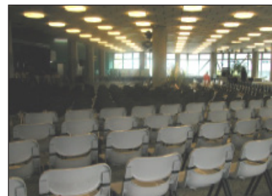
Concert seating in the building HPH